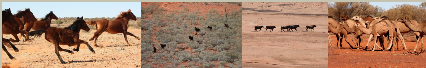
Above photographs were taken by ABRU at the research study site within 30 km of the conference venue.

With Best Wishes The Australian Brumby Research Unit Team